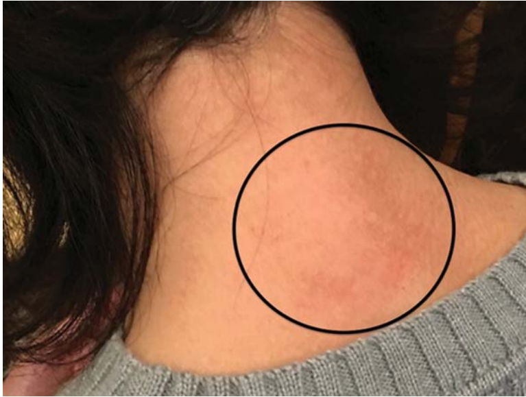
Figure 2. The birthmark of Tomiko.